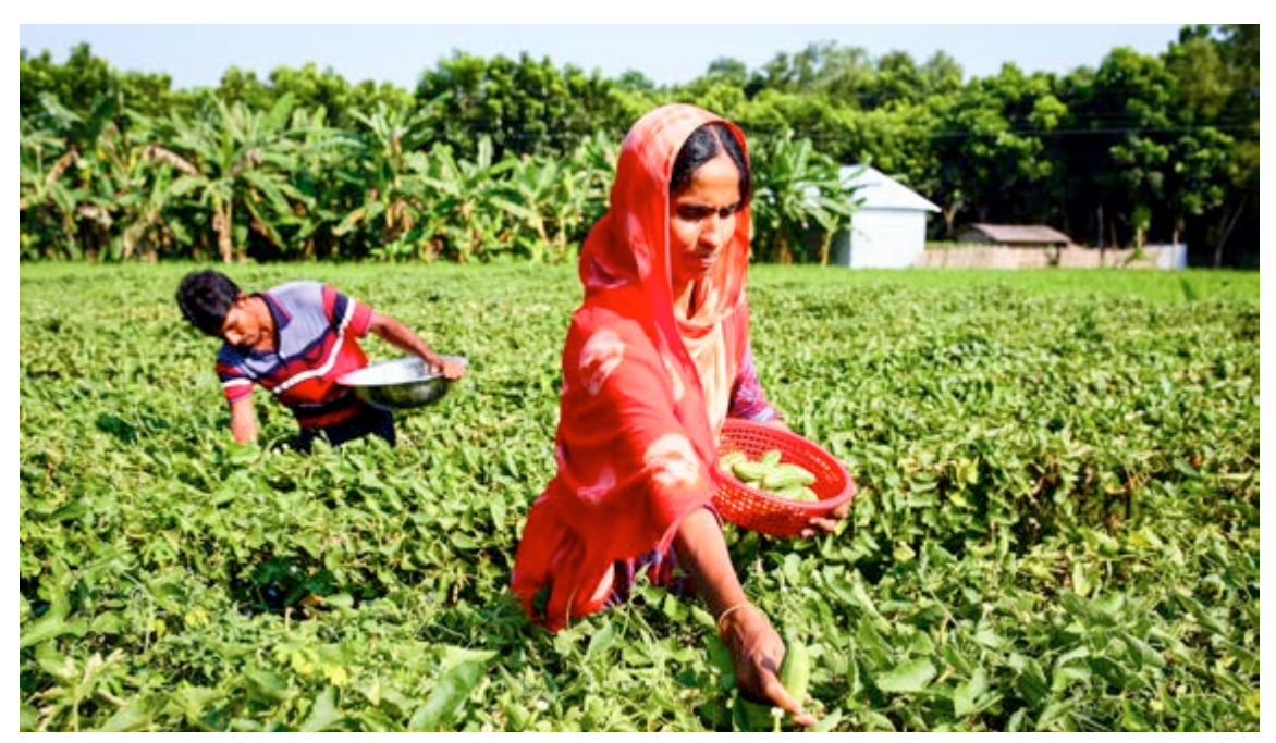
Smallholder tea farmers pick tea leaves in rural Bangladesh.

new obligations when it comes to respecting rights. In some cases, WTO rules undermine the ability of countries to impose restrictions on products if they are linked to poor working conditions or human rights violations. It is clear that in increasingly global food supply chains, human rights and labour rights need to be addressed through trade policy. Without binding rules on labour rights and human rights, FTAs have so far failed to respond to abuses arising within global food value chains in any comprehensive or meaningful way.